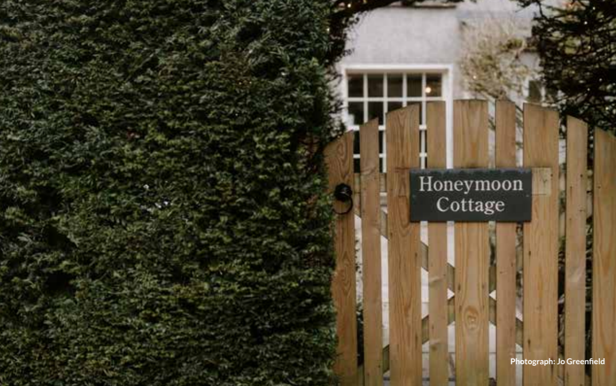
Photograph: Jo Greenfield