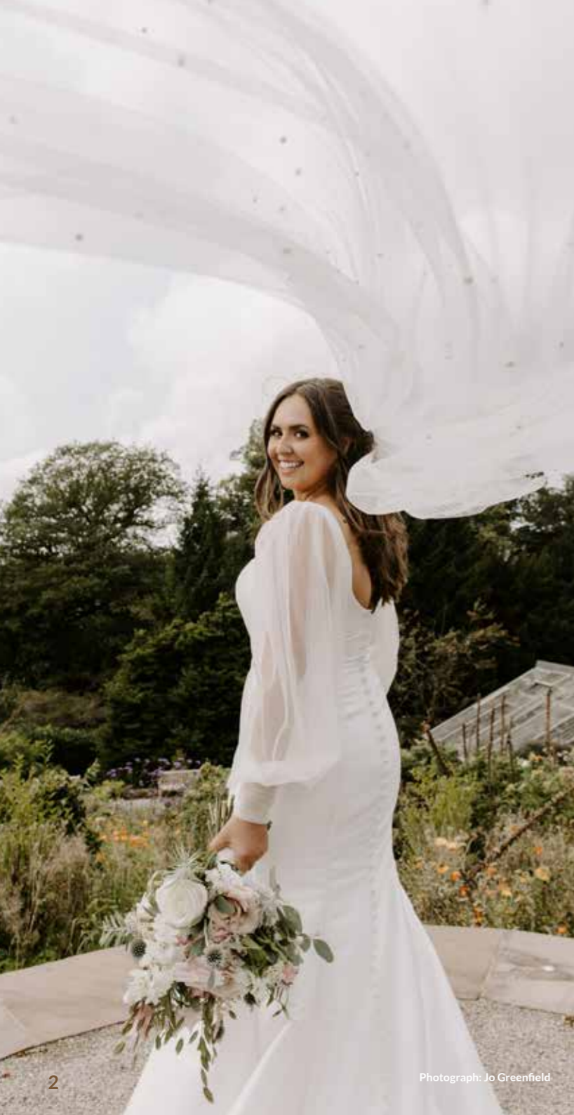
Photograph: Jo Greenfield