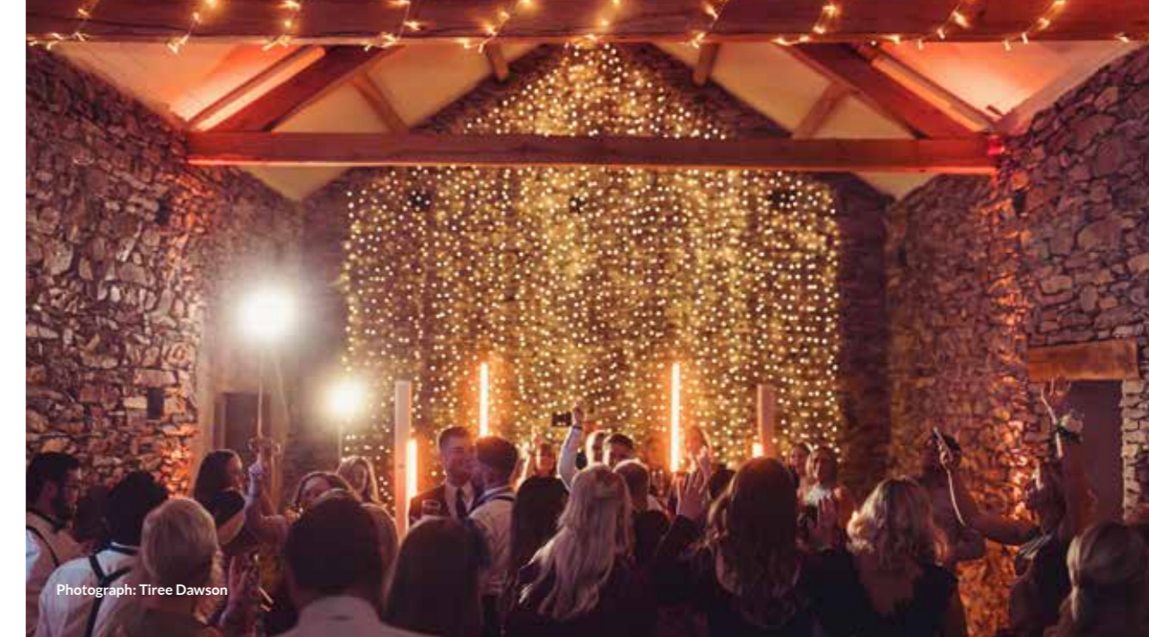
Photograph: Tiree Dawson